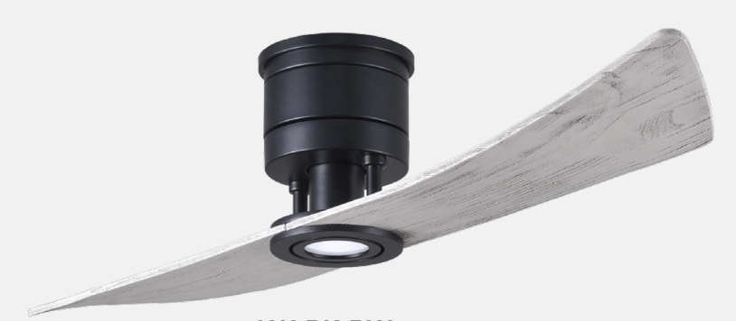
LW-BK-BW Matte Black Finish, with Barn Wood Tone Blades