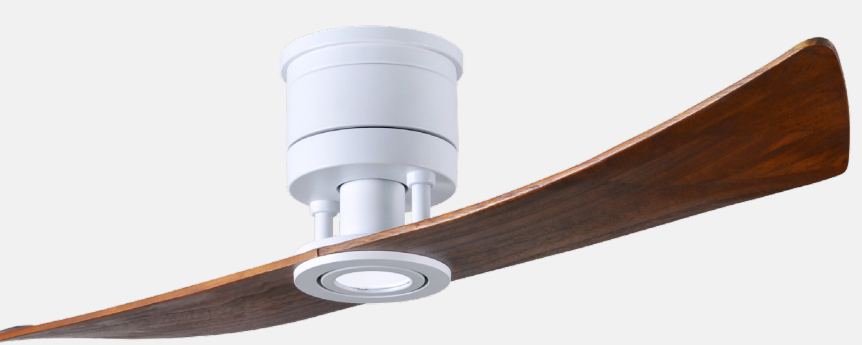
LW-WH-WA Gloss White Finish, with Walnut Tone Blades