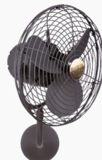
MP-BZZT Bronzette Finish