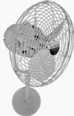
MP-BN Brushed Nickel Finish