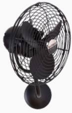
MP-BK Matte Black Finish